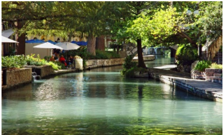
Take a Boat Tour or Stroll along San Antonio's River Walk

Delta's success at finding its Brothers-in-Arms makes its reunion the place to be. 72 veterans gathered in Tucson in 2017, and we want to exceed that at San Antonio in 2018. Regiment and Division reunions have never attracted that many Delta Vietnam Veterans. Not even close, so San Antonio is where you're most likely to see those you served with. Don't put it off. We know you're sure you'll make it to “next year,” but for many (see “Fiddler's Green”) there won't be a “next year.”